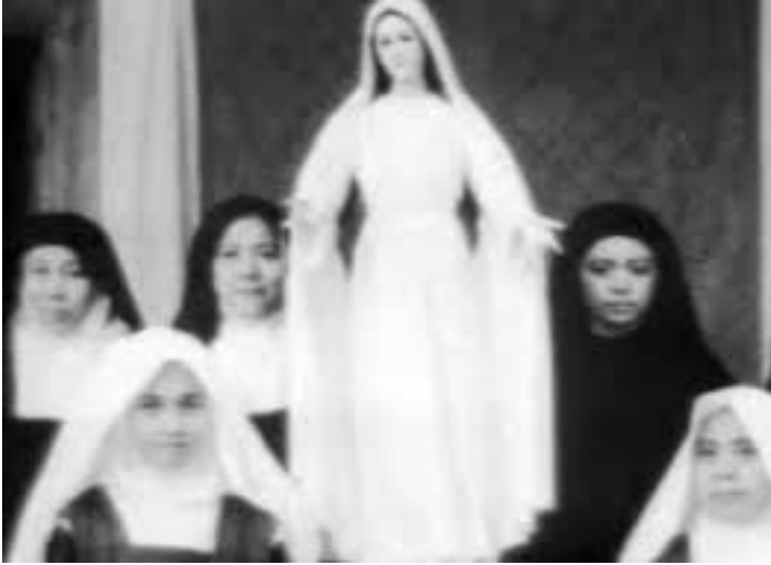
Marian apparition in Lipa

The Catechism of the Catholic Church sets the standard by which the faithful should approach any claimed Apparition, private revelation or message associated with them: "The Christian economy, therefore, since it is the new and definitive Covenant, will never pass away; and no new public revelation is to be expected before the glorious manifestation of our Lord Jesus Christ." Yet even if revelation is already complete, it has not been made completely explicit; it remains for Christian faith gradually to grasp its full significance over the course of the centuries. "Throughout the ages, there have been so-called "private" revelations, some of which have been recognized by the authority of the Church. They do not belong, however, to the deposit of faith. It is not their role to improve or complete Christ's definitive Revelation, but to help live more fully by it in a certain period of history. Guided by the Magisterium of the Church, the sensus fidelium knows how to discern and welcome in these revelations whatever constitutes an authentic call of Christ or his saints to the Church. "Christian faith cannot accept "revelations" that claim to surpass or correct the Revelation of which Christ is the fulfillment, as is the case in certain non-Christian religions and also in certain recent sects which base themselves on such "revelations." (CCC #65-67)