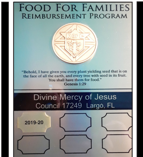
This plaque was received from Supreme for the distribution of chickens at Thanksgiving