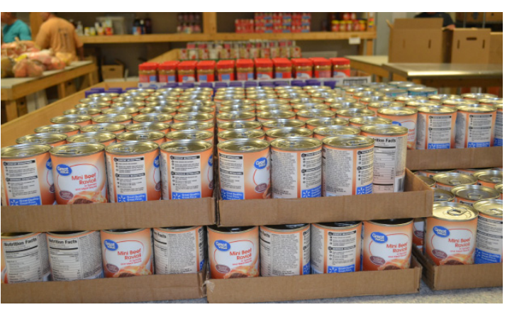
Some of our members help in the Ed Kilroy building, peparing various food items to be distributed to the needy.