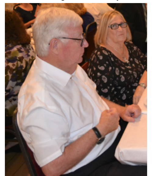
Enjoying a corporal meal