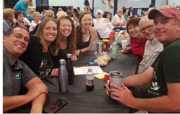
Our council helped with Trivia Night