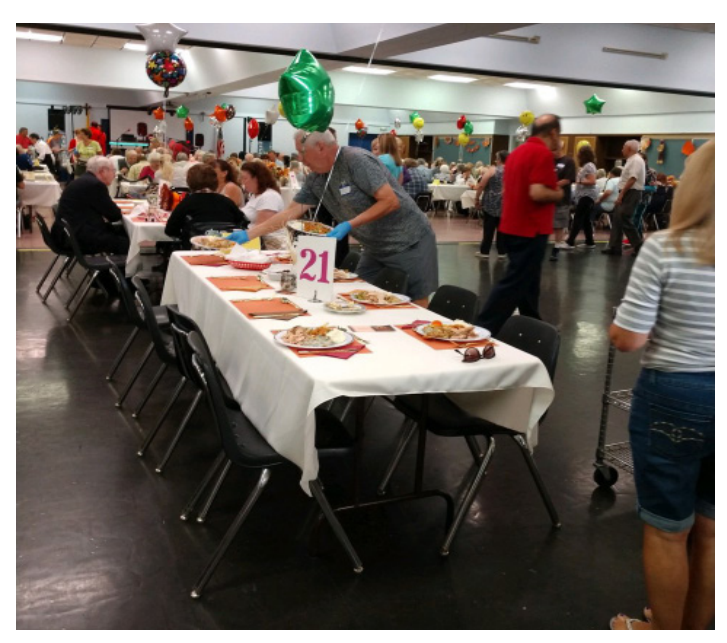
Always helping in the Parish Center with various gatherings.