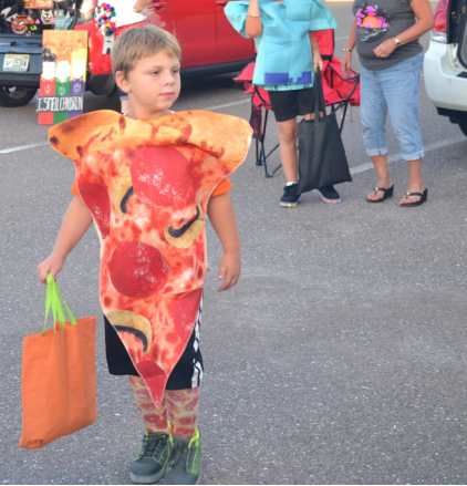
A handsome slice of pizza.