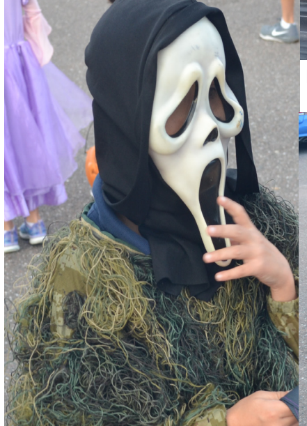
One of the many monsters at the Trunk or Treat.