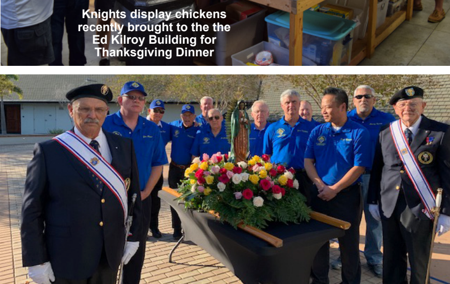
Carrying Our Lady of Guadalupe,