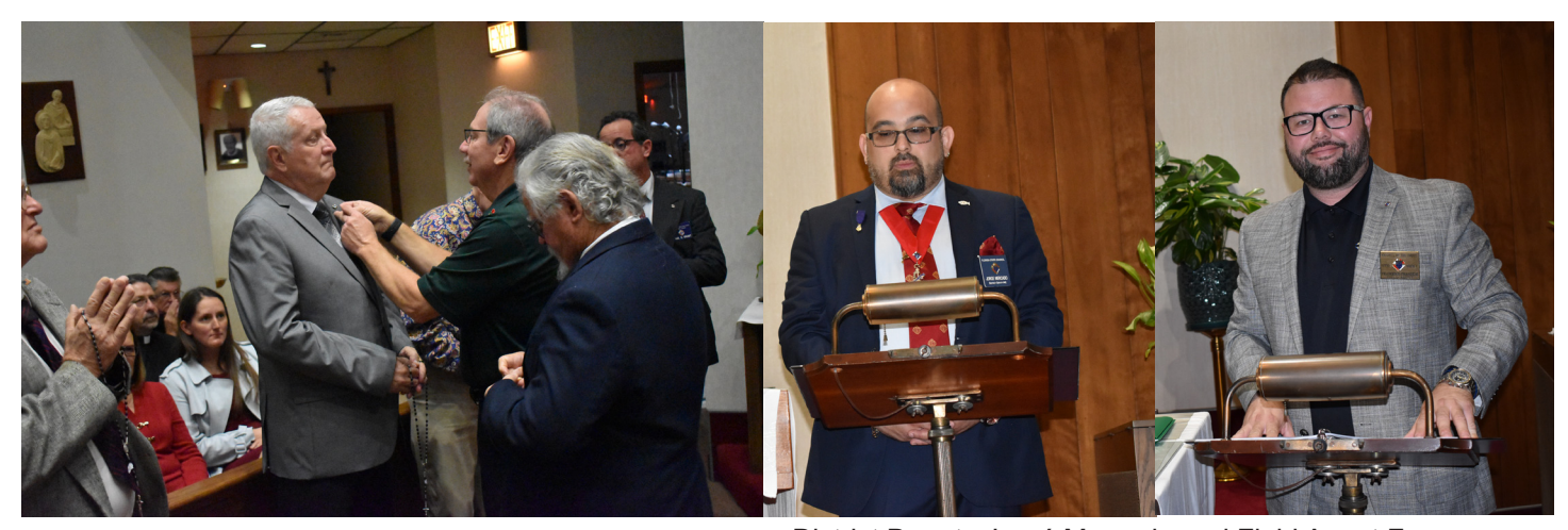
Incoming members are getting their Rosary and pin.