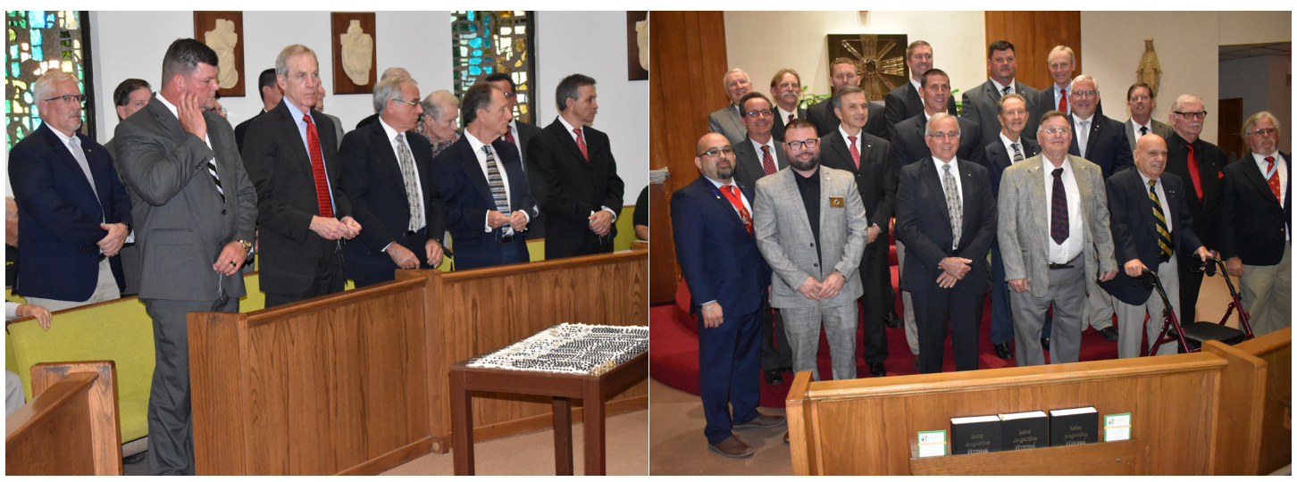
Ready to take on the world.