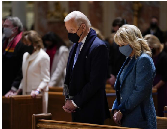
President Joe Biden and wife Jill attend Mass