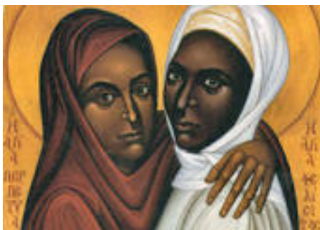
Perpetua and Felicity

Saints Perpetua and Felicity were Christian martyrs who lived during the early persecution of the Church in Africa by the Emperor Severus. We are fortunate to have the actual record of the courage of Perpetua and Felicity from the hand of Perpetua herself, her teacher Saturus, and others who knew them.