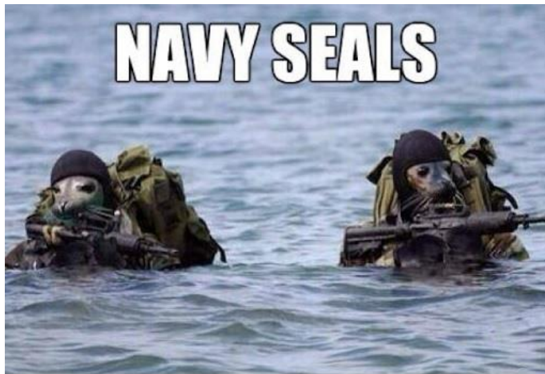
Real Hard Training