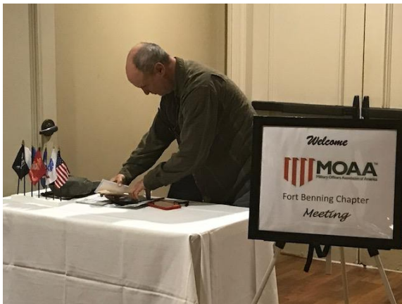
PHOTO GALLERY OF OUR JANUARY MEETING