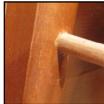
Dowel inserted in place.

In order to install toggles, 1/4" holes are drilled through the rib and soundboard at regular intervals from one end of the separation to the other. Woodworking glue is then worked into the space between the rib and the soundboard so that when the toggles are inserted and tightened down, the clamping action of the toggles produces a tight bond.