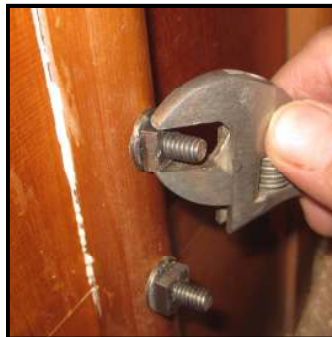
Toggle being tightened

One effective method of fixing the problem is to insert soundboard toggles to serve as clamps so that the ribs may be properly reglued to the soundboard. This repair may be accomplished on site, although more than one visit will be required to allow time for the process to be performed. The ribs of your piano are loose or separating from the soundboard and need to be repaired in order for the piano to sound its best.