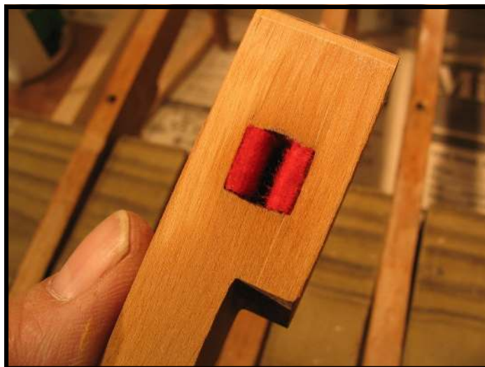
A key which has been professionally rebushed.

Functionality of the Parts: The wooden portion of the key (the "keystick") operates much as a child's teeter-totter. The center of each key rests on the balance rail, which serves as the fulcrum. Two polished "keypins" (front rail pin and balance rail pin) keep the key tracking in a straight line. Felt punchings (the green and white felts in the photos above) cushion the keys from underneath, and felt bushings (the red felts in both photos) help to make sure that each key has a snug fit and is silent in its operation.