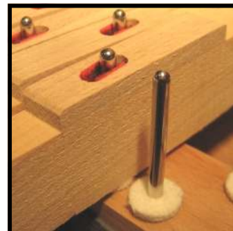
Balance rail bushings