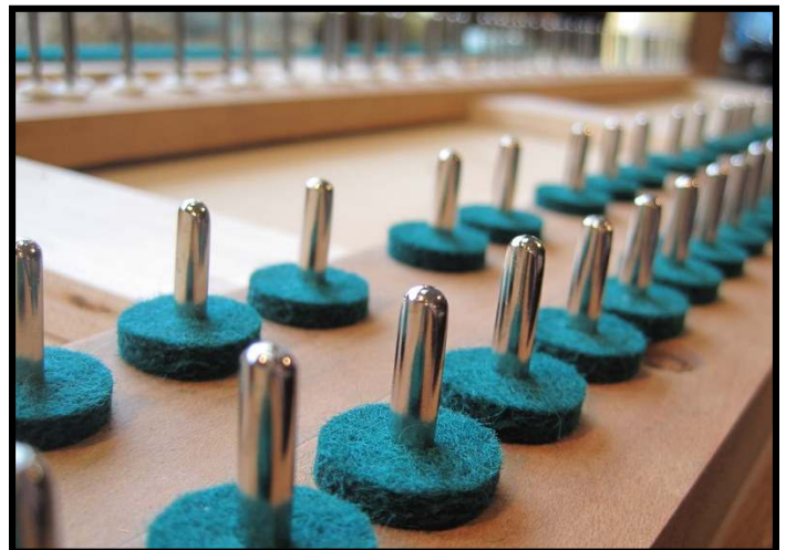
New set of keybed felts in place.

Keybed felts come in a range of thicknesses, so that the original size of the felt installed at the factory may be duplicated. Paper and card punchings as thin as .002" are used under the felts for final adjustments necessary for level keys and even key dip.