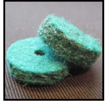
Front rail punchings

The felt used for backrail cloth, as well as the balance rail and front rail punchings, is a very thick, dense felt that is designed to stand up to decades of constant use.