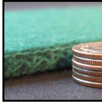
Back rail cloth

As the keybed felts harden and wear thin the keys become uneven in height from note to note. Also the amount of downward stroke (key dip) begins to vary, resulting in an action which has an uneven touch. A perfectly level set of keys with a uniform amount of key dip is essential to a piano action which is performing up to its potential.