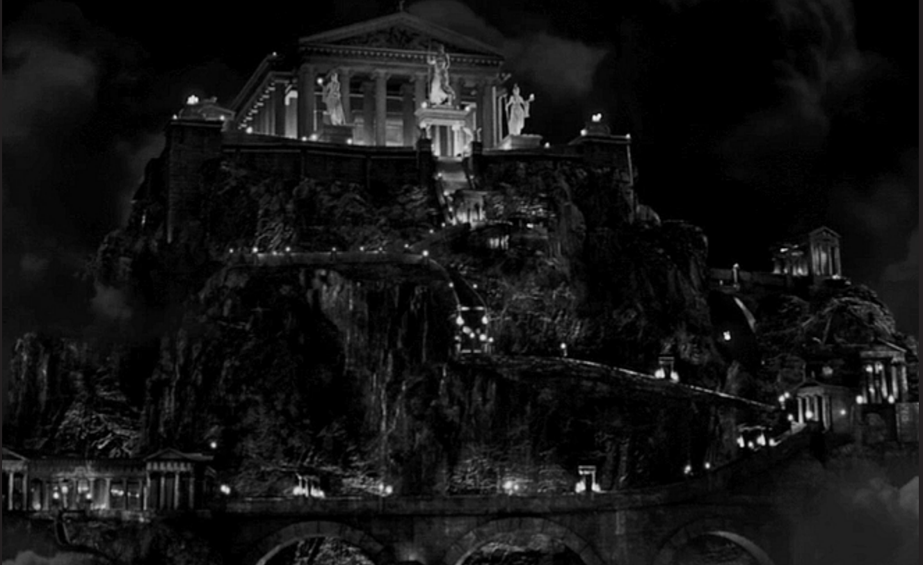
(Percy Jackson and the Olympians: The Lightning Thief, Dir. Chris Columbus, © 2010 20th Century Fox)

Reapers is meant to be a dark, but thrilling, supernatural saga. It is geared towards a teenage and young adult audience and will not shy away from intense, compelling story lines, while still leaving room for softer moments and strong character development.