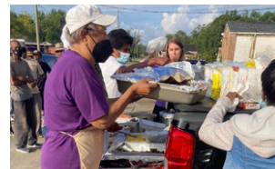
Mt. Zion Missionary Baptist Church