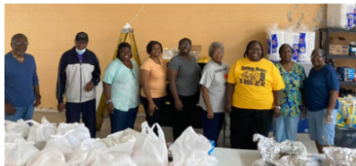
Cherry Grove Missionary Baptist Church

Pictured below are just a few of the groups who have recently served.