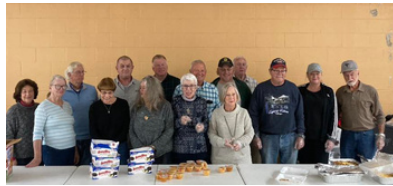
Darlington Presbyterian Church