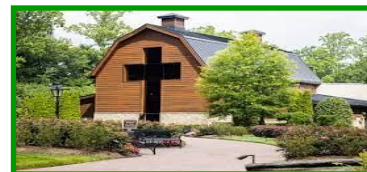
BILLY GRAHAM LIBRARY