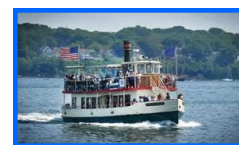
Lighthouse Lover's Cruise