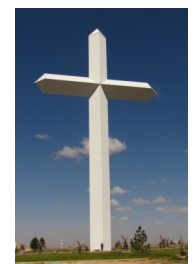
The Cross Groom, TX

Trip Deposit: $200 Optional Trip Protection Insurance $150 Due At Sign-Up With Deposit