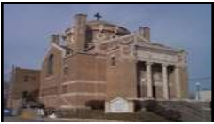
St. John's Greek Orthodox Church