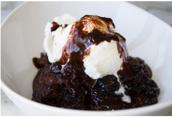
Brownies with Guinness Fudge Sauce