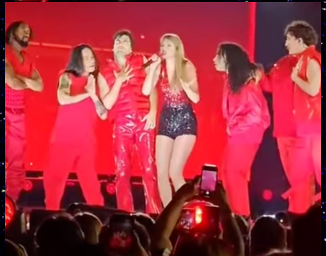
KEVIN "KID XS" w/ Taylor Swift in the "Eras" tour