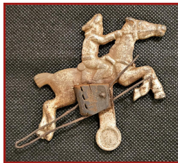
Artifact Single Bill Green