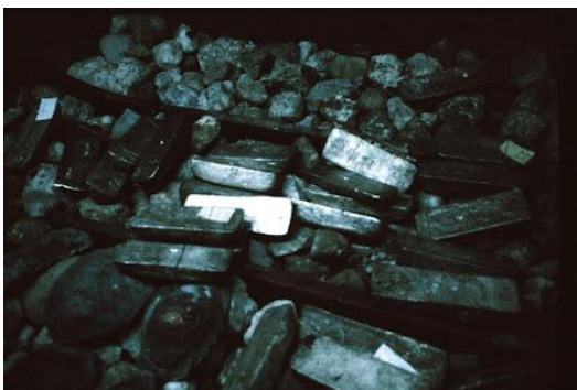
Treasure, fresh off the Atocha in 1987 - We got a free Preview!

The modern metal detectorists (treasure hunters) seem oddly uninterested in finding treasure: "I know I'm never gonna' get rich!" or "We're not really going to find anything," they all say, quite modestly. I hear it all the time. My question has always been, WHY NOT?? When I started treasure hunting (with a metal detector) almost 60-years ago, we literally thought anything was possible. An old cache of buried confederate rifles, maybe even some of that civil war gold hidden somewhere near Gainesville by the fleeing Confederate soldiers. Scuba diving for sunken treasure still trapped aboard fleets of sunken Spanish Galleons, covered in sand. Literally nothing was off the table...and it was always GO time!