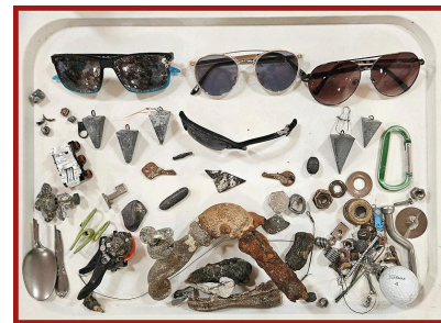
Odds & Ends Group Gage Dover