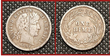
Coin Single Gary Dover