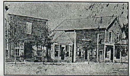
Gainesville in 1875

Totally forgotten is Newnansville, which once seemed destined to become a great city. In 1828, Newnansville became the Alachua County seat. In 1832, Newnansville became part of the newly created Columbia County. In 1839 it was returned to Alachua County. Congress