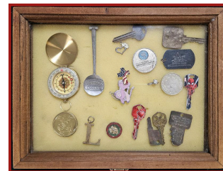
Odds & Ends Group Bill Green