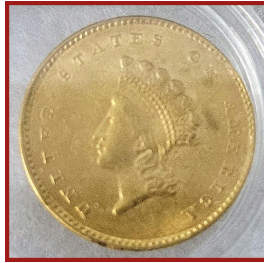
Coin Single Rob Hill