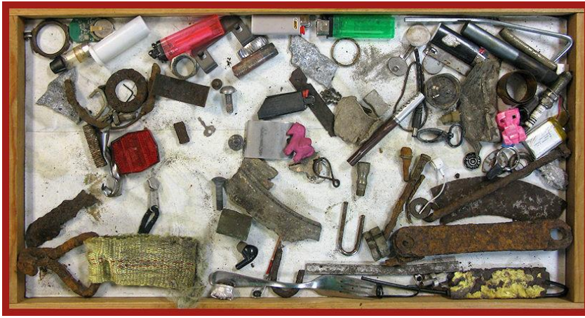
Odds & Ends Group 1 st