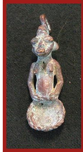
Artifact Single 1 st