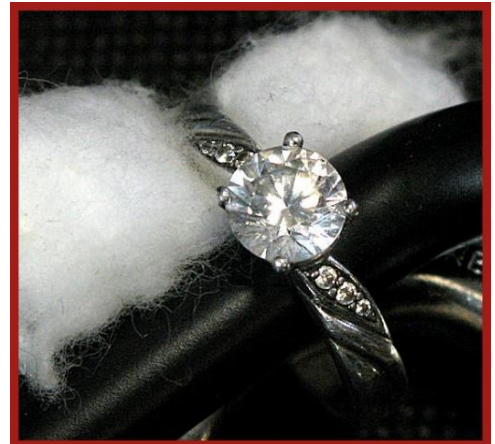
Jewelry Single 1 st