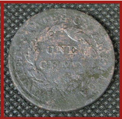
Coin Single 1 st