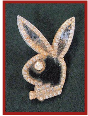
Odds & Ends Single 1 st