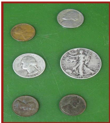
Coin Group 1 st