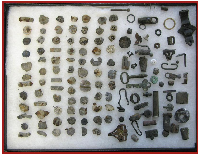
Artifact Group 1 st