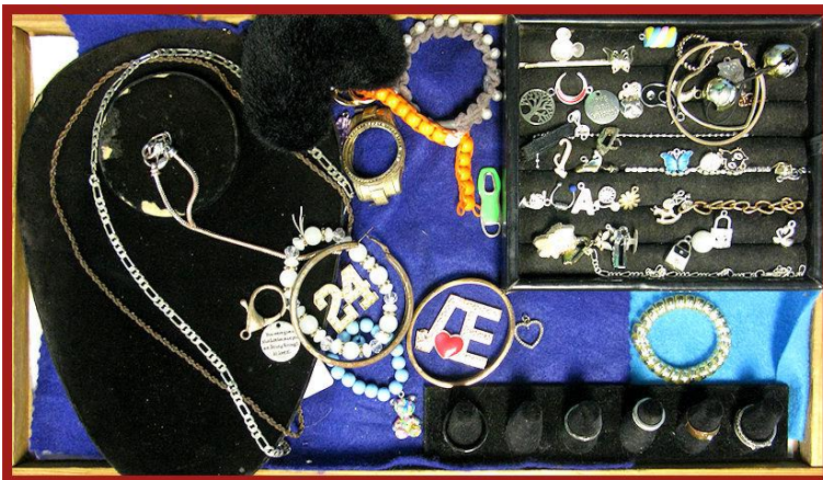
Jewelry Group 1 st