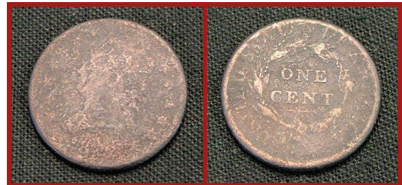
Coin Single Gage Dover