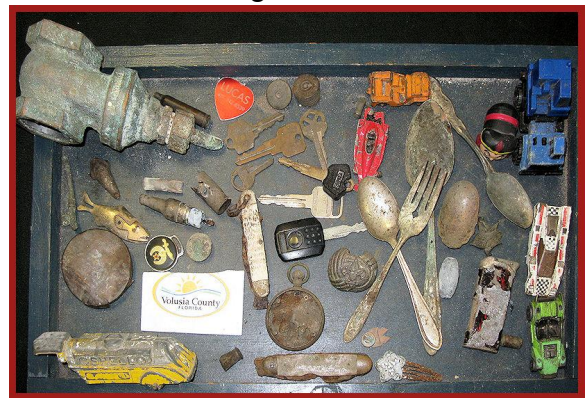
Odds & Ends Group Gage Dover