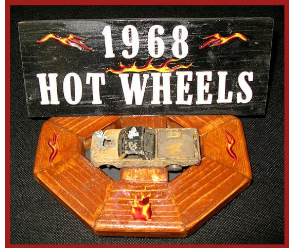
Display of the Month Roy Peters