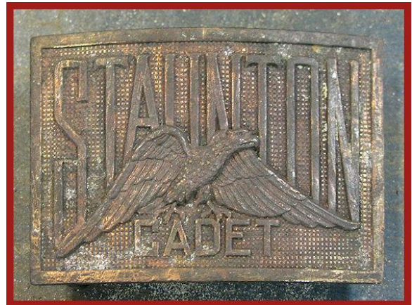
Odds & Ends Single Gage Dover