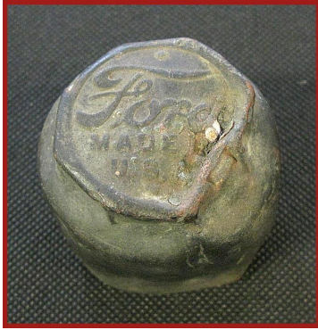
Artifact Single Gage Dover