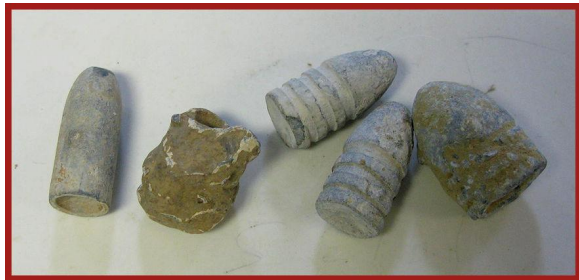
Artifact Group Gage Dover