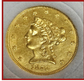
Coin Single Gary Flatt