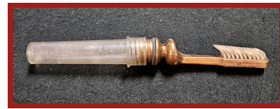
Odds & Ends Single Bill Green