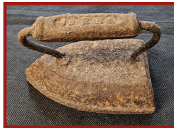
Artifact Single Gary Dover