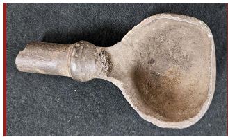
Artifact Single Rob Hill