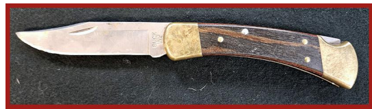
Odds & Ends Single Danny Case