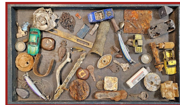
Odds & Ends Group Gage Dover