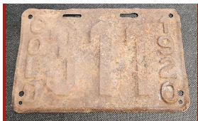
Artifact Single Bill Green