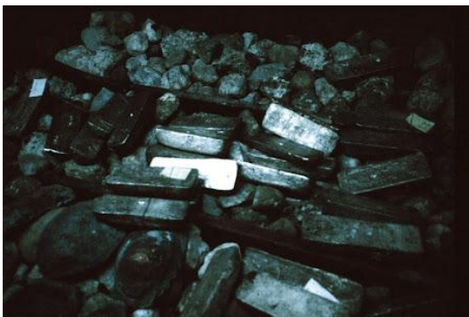
Treasure, fresh off the Atocha in 1987 - We got a free Preview!

The modern metal detectorists (treasure hunters) seem oddly uninterested in finding treasure: "I know I'm never gonna' get rich!" or "We're not really going to find anything," they all say, quite modestly. I hear it all the time. My question has always been, WHY NOT?? When I started treasure hunting (with a metal detector) almost 60-years ago, we literally thought anything was possible. An old cache of buried confederate rifles, maybe even some of that civil war gold hidden somewhere near Gainesville by the fleeing Confederate soldiers. Scuba diving for sunken treasure still trapped aboard fleets of sunken Spanish Galleons, covered in sand. Literally nothing was off the table...and it was always GO time!