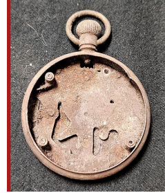
Odds & Ends Single Gage Dover