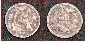
Coin Single Gage Dover