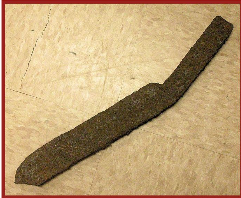
1 st Place - Patti Fielding: Iron Knife