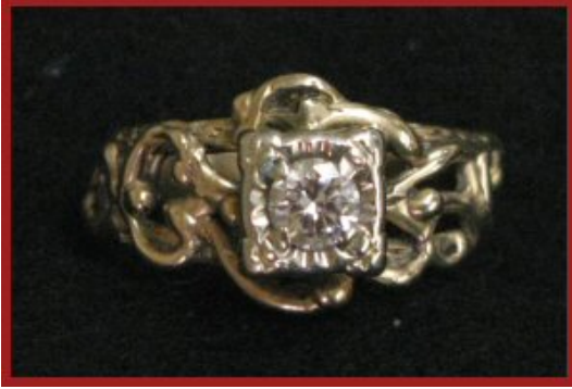
Single Jewelry - Betty Shackelford