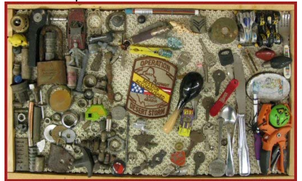
Group Odds/Ends - Bill Green