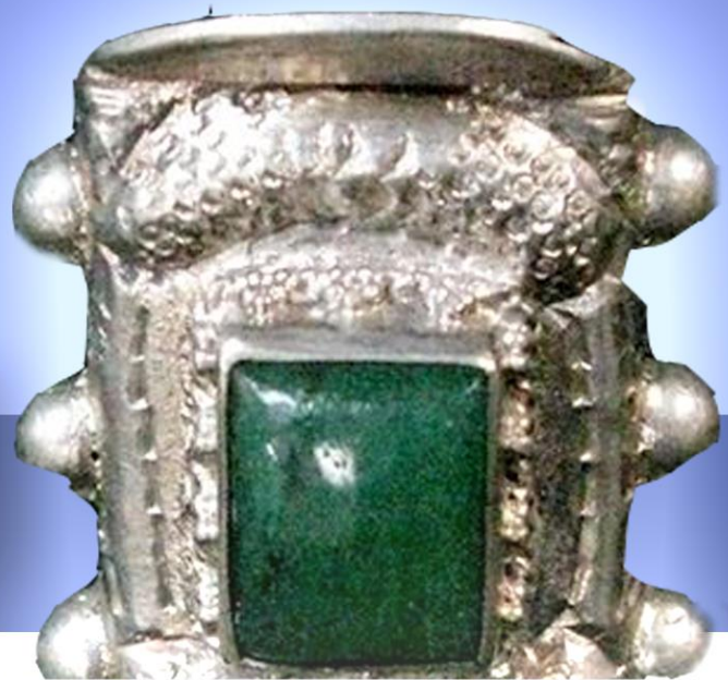
Gary Dover's Silver ring!