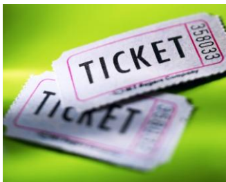
50/50 Drawing -- No winner