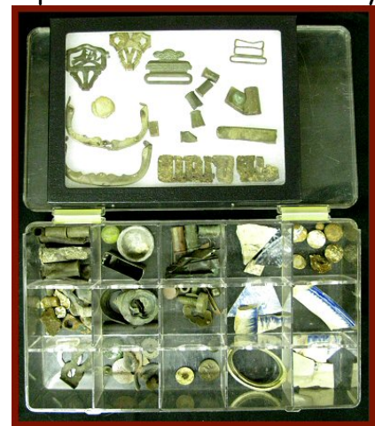
Single Odds/Ends - Bill Green