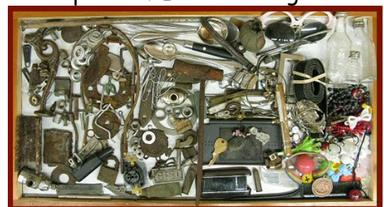
Group Odds/Ends - George Case