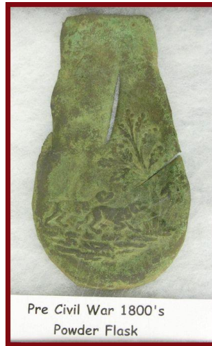
Pre Civil War 1800's Powder Flask