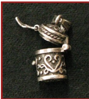
Single Odds/Ends - Bill Green