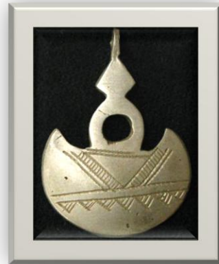
Single Odds/Ends - Paul Swaney