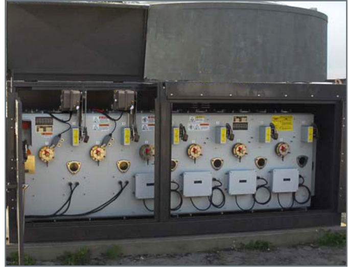
▲ Arc Resistant TNI.

To maximize operator safety, G&W has created a distinct switch tank geometry to contain an internal arc fault of 25kA for 0.25 seconds in SF6 according to IEC62271-200 standard. The tank is able to withstand an internal