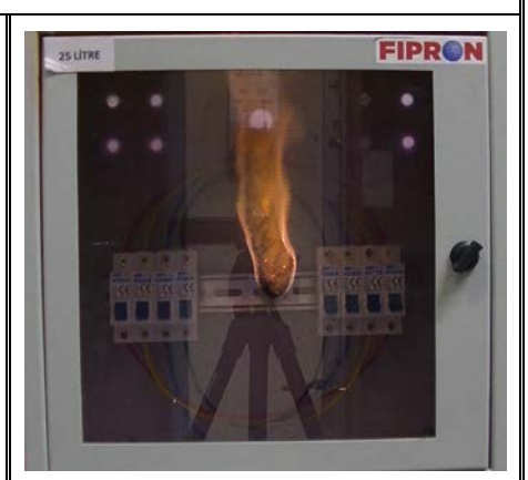
Photograph during a test