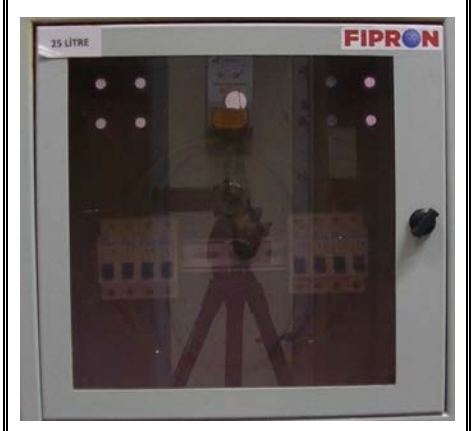
Photograph after a test

Document No.: 410056 Page No.: 11 of 12 Author: T. Kinder Issue Date: 12th April 2019