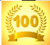
Huntington Downtown Lions