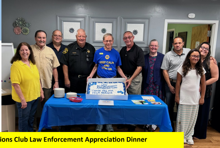
Lions Club Law Enforcement Appreciation Dinner