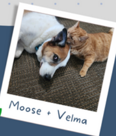
Moose + Velma