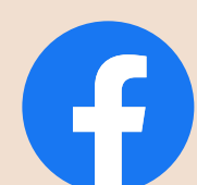
FSLC Sub Club Facebook group