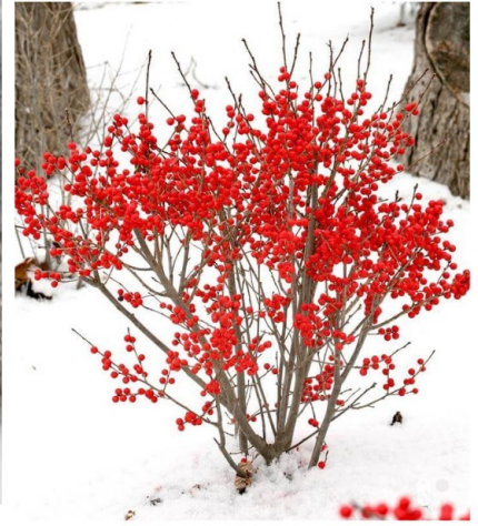
Picture Top Row: Beautyberry, American Holly, Christmas Rose, Eastern Hemlock, Witch Hazel Second Row: Eastern White Pine, Eastern Hemlock Third Row: Little Bluestem, Switch Grass, Michigan Holly