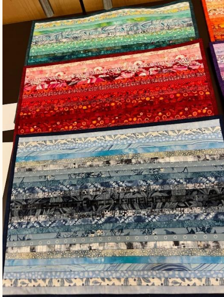
Strip Placemats planned for September 2023