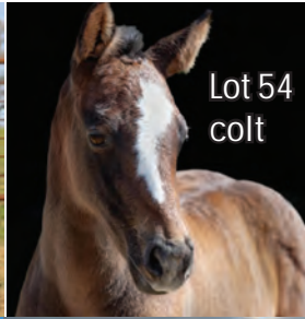
Lot 54 colt