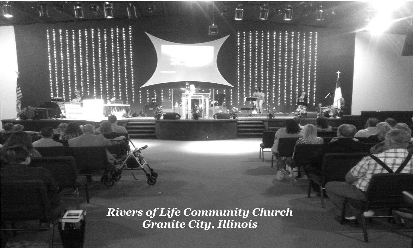
Rivers of Life Community Church Granite City, Illinois

"How great are His signs! And how mighty are His wonders! His kingdom is an everlasting kingdom, & His dominion is from generation to generation." Dan. 4:3