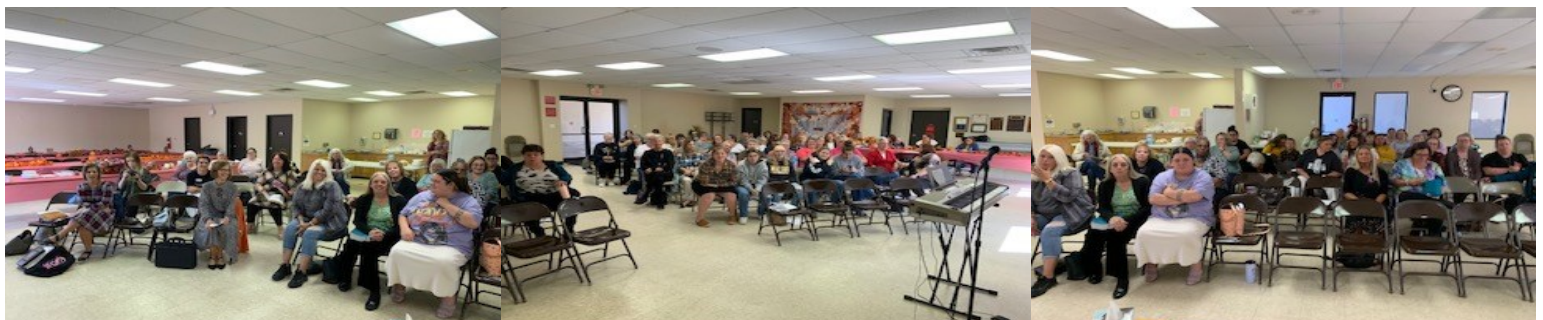
The Ladies of FGCI Churches