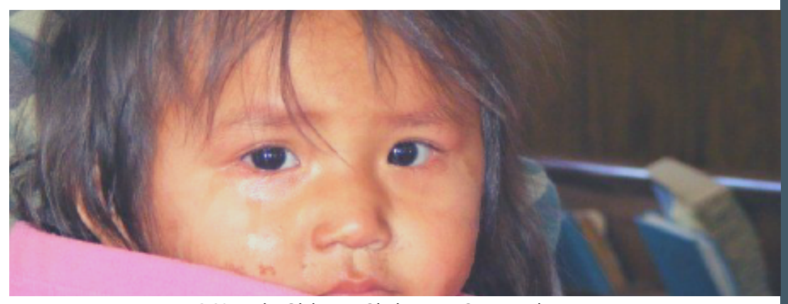
A Navajo Girl at a Christmas Outreach