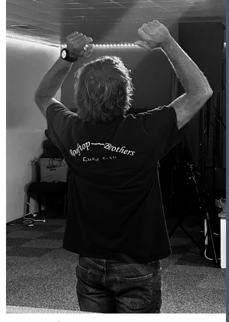
One of our men worshiping at Mens Conference 2023

First and foremost, I want to thank the governing body (the ministers at convention), the General and Executive Boards for their trust in me to perform this most crucial role for our fellowship, this is not taken lightly. Secondly, as I am sure you all can see there are changes and will continue to be changes, as the only constants in life are God's goodness and change. So, as we move forward with not only The Echoes, Facebook, and website but branch into new and different ways to spread the Gospel. I ask you to help me, give me ideas, and be a part in sharing how great this fellowship is via as many channels as possible. I want your input, your feedback, and your ideas to help make our reach wider and our message clearer.