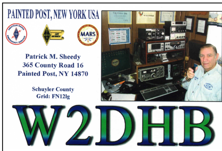
QSL Card from a 2011 AM QSO