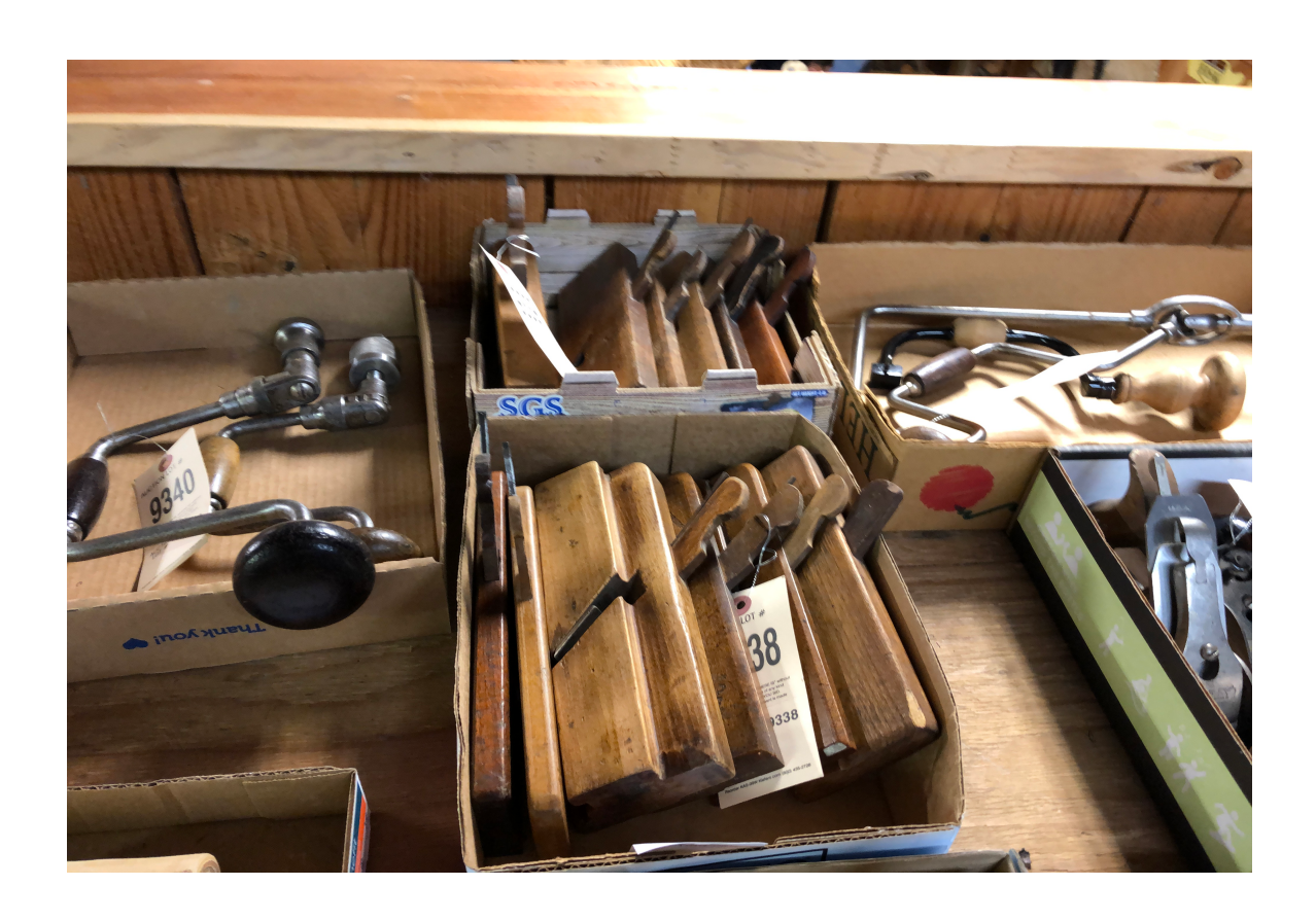
PNTC-November Business Meeting