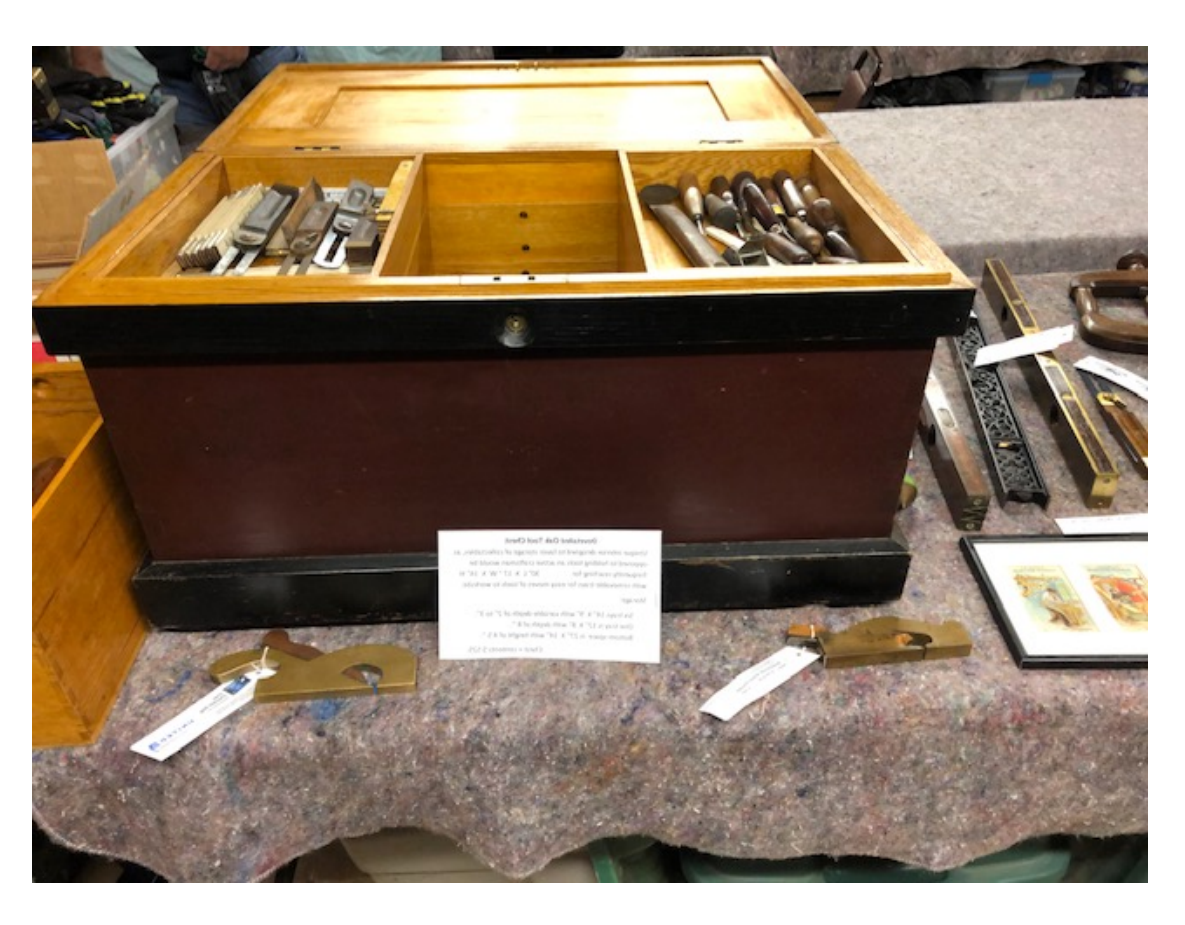
Dovetailed Oak Tool Chest 30^{\circ} L x 17^{\circ} W x 14^{\circ} H Chest + Contents $525 Unique interior designed to favor storage of collectables