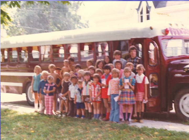
Fountain Sunday School Bus