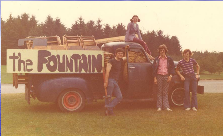
Our first mobile Gospel team!