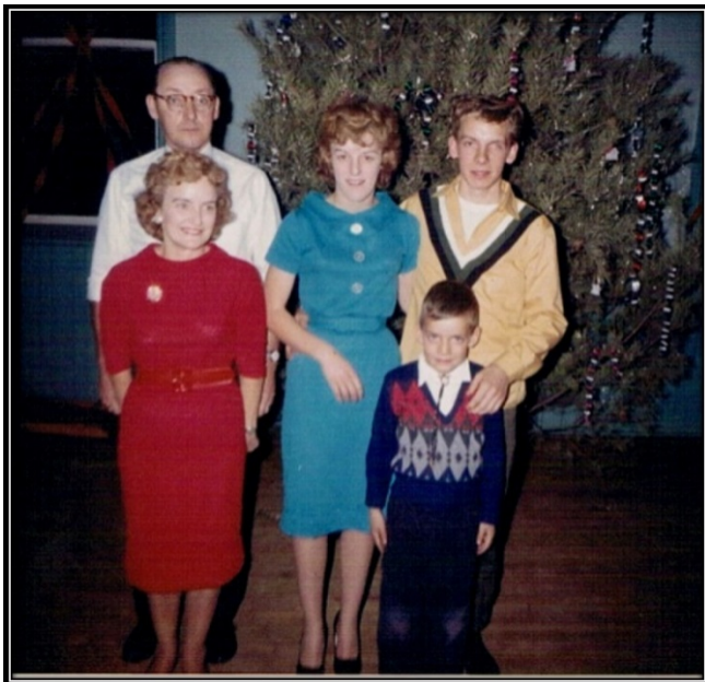
The Humphries Family