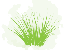
Rushes & Grasses