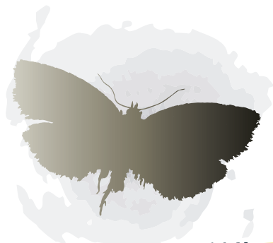
Apotomis infida – for which Ettrick Marshes is now the only known location in the UK.

Areas of ancient birchwood and wet willow habitat are a hotspot for moths too. The most recent moth-trapping in summer 2022 added 33 species to the list of moths found in the area, including one real rarity – Apotomis infida – for which Ettrick Marshes is now the only known location in the UK.